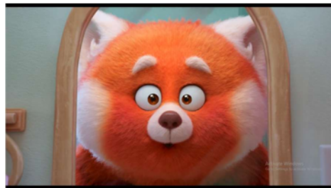
figure 2. the first moment of "Turning Red"

As has been stated in the previous paragraph, the Visual modes that the writer has and will be analyzed, consist of ten different visual modes. The first visual mode is taken from a scene (see figure 2) during the play from minute 16:22 to 19:14. This is the first moment when the actor changed the color from white into red.