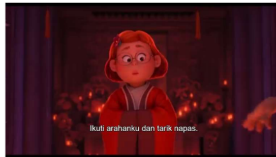
Figure 3. The moment Mei performs the ritual

is captured from the scenario (see figure 3). This is the first time the actor goes through the procedure of becoming human again. However, Mei attempts to stop the ceremony because the actor cannot be separated from the red panda.