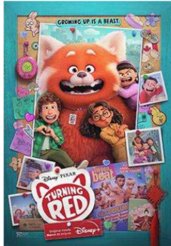
Picture1. "Turning Red" Poster

As has been stated in the previous paragraph, the Visual modes that the writer has and will be analyzed, consist of ten different visual modes. The first visual mode is taken from a scene (see figure 2) during the play from minute 16:22 to 19:14. This is the first moment when the actor changed the color from white into red.