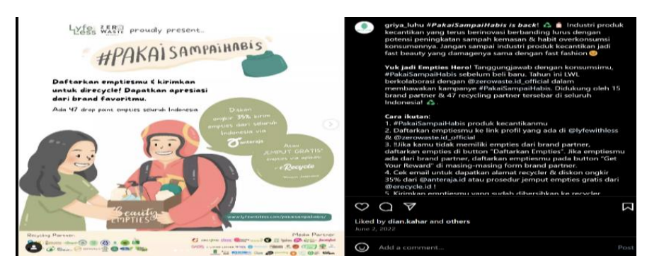
Figure 3. Posts About Plastic Diet

This hashtag frames the problem of waste and a "disposable" culture as a key issue. The focus is not on environmental pollution in general, but rather on excessive consumption behavior and the habit of throwing away items that can still be used. This hashtag implicitly places individuals as the main actors in overcoming problems. The use of the word "Use" shows that everyone has a role and responsibility in the use of their items. so that this offers a simple and easy to implement solution, namely using the items you have until they are completely used up or not suitable for use. The focus is on changing individual behavior in daily activities.