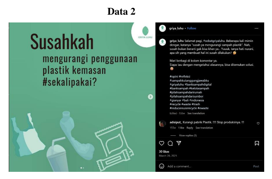
Figure 2. Posts About Single-use Plastic

three elements, namely God, humans and nature, can coexist, thereby creating harmony. If harmony occurs then a happy, prosperous and peaceful life is achieved (Peters & Wardana, 2013). In general, Tri Hita Karana contains the concept of a harmonious relationship between humans and God called Parahyangan , the concept of harmonization between humans and humans is called Pawongan , and the concept of Mutual love between humans and their environment is called Palemahan . (Peters & Wardana, 2013).