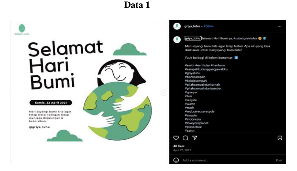
Figure 1. Posts About Earth Day

Framing analysis of hashtags was carried out to find out how hashtags can frame the minds of Instagram users so as to form an understanding of environmental conservation efforts in Bali. The framing concept in the ecolinguistic theory "Story We Live By" popularized by Arran Stibbe refers to how to understand and interpret the world through language, as well as how language shapes a person's collective understanding of environmental conservation issues. The basic idea behind this concept is that language is not only a means of communication, but also a form of social reality in society (Stibbe, 2015).